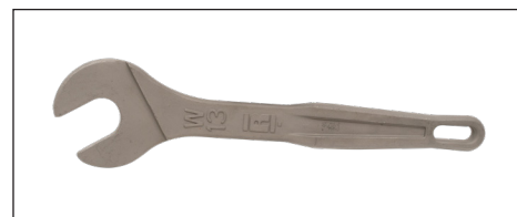
Model W13 Wrench