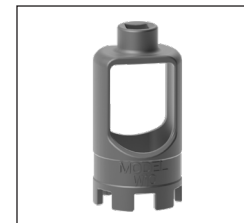
Model W10 Wrench