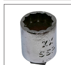
Model ZX Wrench