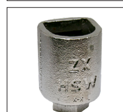
Model ZX-HSW Wrench