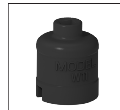
Model W11 Wrench