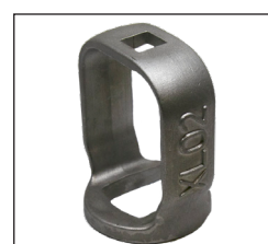
Model XLO2 Wrench