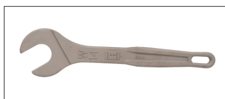
Model W14 Wrench