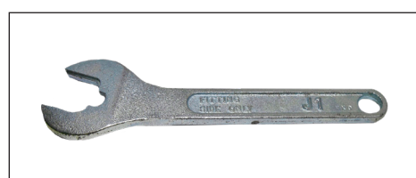
Model J1 Wrench