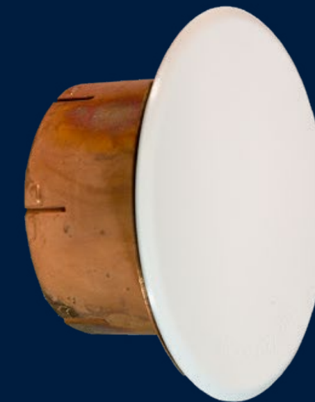
RFC Cover Plate